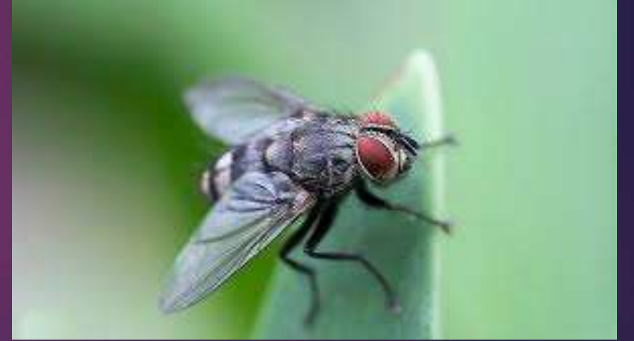
ನೊಣ – Nona HOUSE FLY