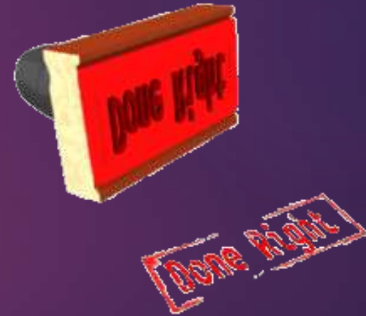
ಠಸೆ - Thasse SEAL