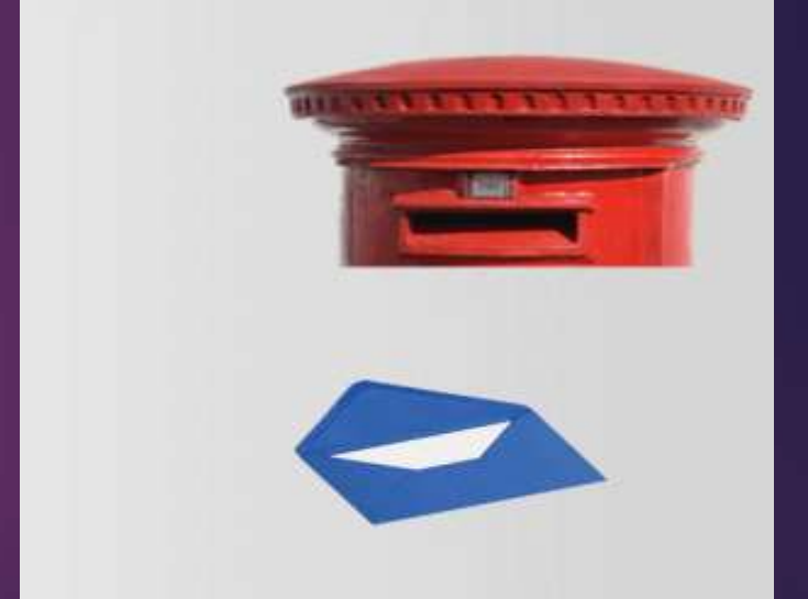
ಟಪಾಲಾ - Tapalu POST