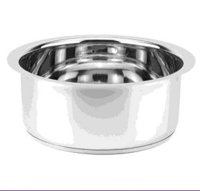
ಡಬರಿ – Dabari COOKING VESSEL