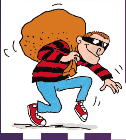
ಠಕ್ಕು - Thakka THIEF