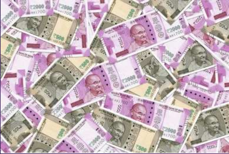
ಹಣ – Hana MONEY