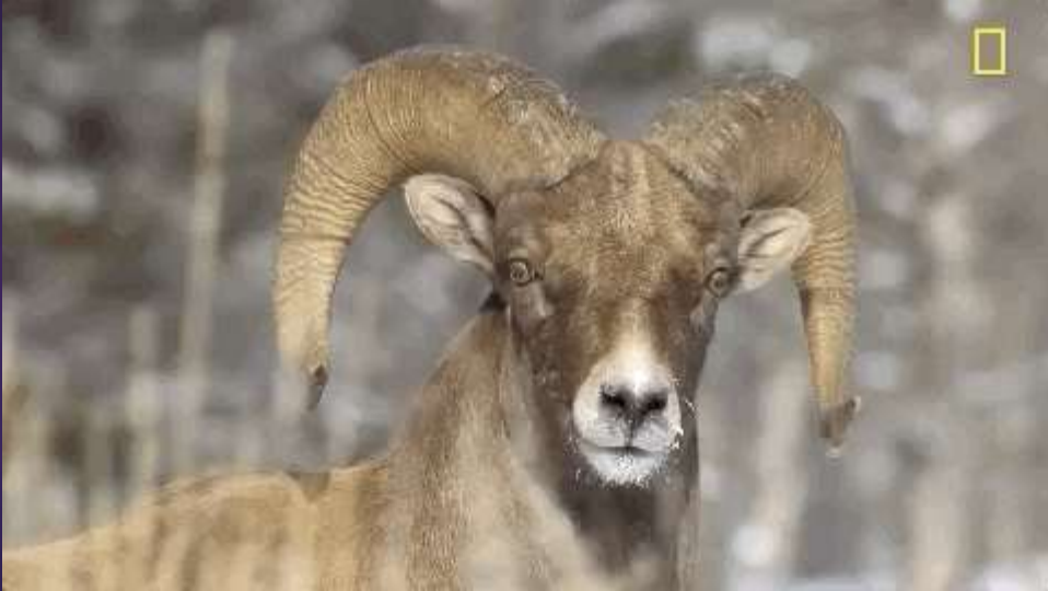
ಟಗರು - Tagaru